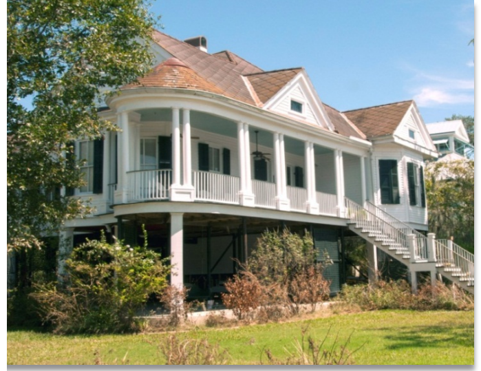
Figure 1: House elevated above the BFE with 1 foot of freeboard

Communities that incorporate freeboard into their local floodplain ordinances can earn discounts on flood insurance by participating in the NFIP’s Community Rating System (CRS) program. CRS rewards communities that engage in floodplain management activities that exceed NFIP standards by offering discounts of up to 45 percent on flood insurance policies written for SFHAs in NFIP-participating communities.